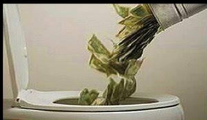
What my wife thinks I do