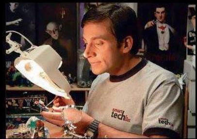
What society thinks I do...