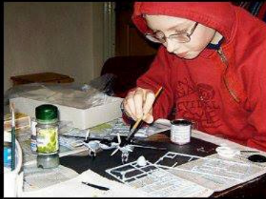
What my mom thinks I do...