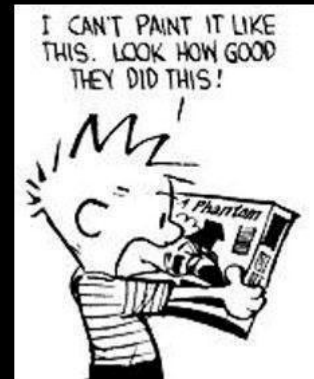
What I actually do...