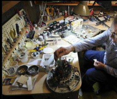
What I think I do...