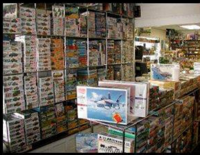
What my wife thinks I do...